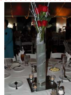
Roses were everywhere at Convention! This was the centerpiece for the Xi C Province Table at the Dinner of honors on Sunday. After the Dinner, all attendees were invited to take a rose with them.